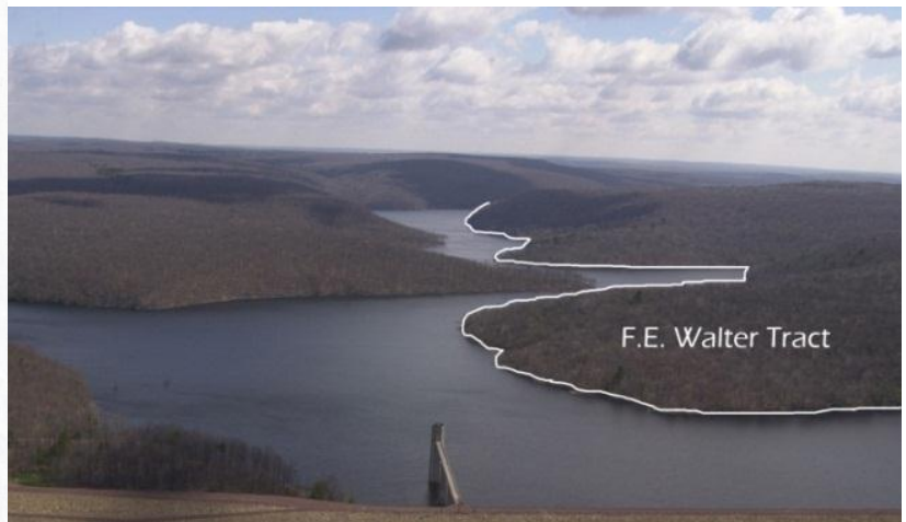
Image courtesy of the U.S. Geological Survey © 2004 Microsoft Corporation. Terms of Use Privacy Statement